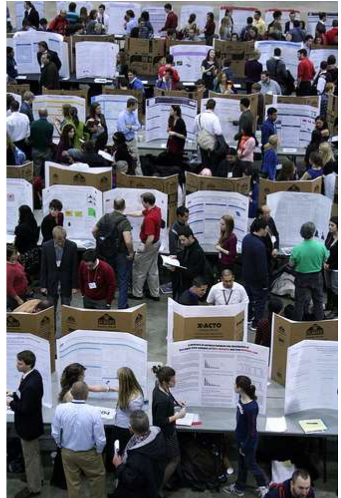
Mathematical Association of America