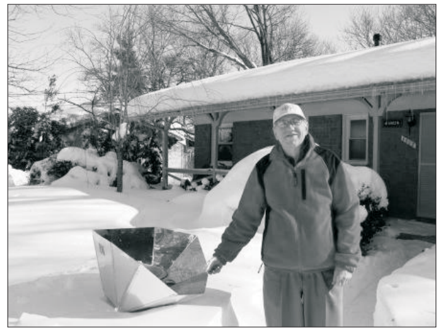
Figure 2. Solar cooking on a snow day in DC, Feb. 2010.

vegetables, rib roasts, hot dogs, hamburgers, and cakes. He is one of many people in Washington DC, and other places around the USA who cook frequently with a solar cooker (figure 2).