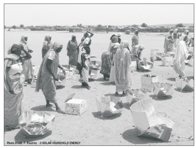
Figure 3. Women solar cooking in refugee camp in Chad.

The preliminary results indicate that introducing solar cooking has caused them [the participants] to reduce their wood use by an average of 25–40% after only two months. These savings are likely to grow over time and could be further increased by additional measures. The users are extremely enthusiastic about their new HotPots and have adapted their cooking to use them every midday meal.<sup>29</sup>