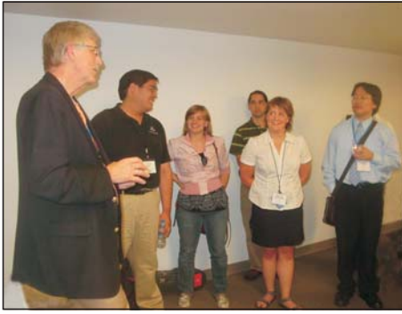
Francis Collins met with students and early career scientists.

of sources, what policy efforts are used globally, and what information should the Christian voter have to think about such decisions? Our goal is that 20% of our electricity be generated by renewable sources by 2020.