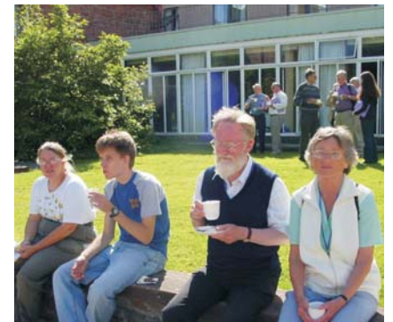
Some attendees enjoyed the beautiful Scotland weather as they conversed with others while sipping their tea or coffee and eating their biscuits.