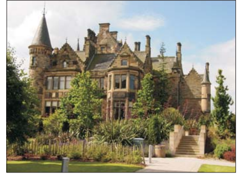
Most of the parallel sessions were held in the opulent rooms of St. Leonard's Hall (1870s).

He reminded us of crucial juxtapositions: “our elevated stature alongside our mortality, our authority over the creation alongside our own need to be subject to a higher authority, the way in which we are cared for by God over against the care and control we are to exercise over the creation and others in the human community.”