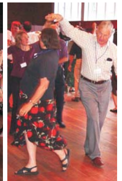
ASAers and CiSers enjoy a Ceilidh, Scottish dances and reels to the music of guitars, fiddle, and drums, led by a kilted master of ceremonies.