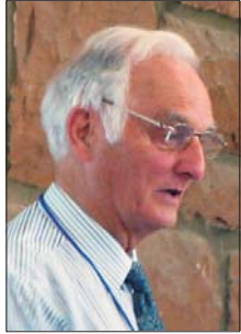
Sir John Houghton

Sir John Houghton, FRS, an emeritus professor in atmospheric physics at the University of Oxford, opened this session with “Global Warming: The Challenge to Scientists and Christians.”