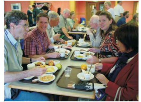
In the John McIntyre refectory, breakfast included a choice from all the usual fare, as well as blood pudding, kippers, and traditional or vegetarian haggis.