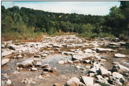
Paluxy River near Glen Rose, TX site of dinosaur tracks.

• The dining hall offered the ultimate place for sharing, debating, discussing, informing and laughing!