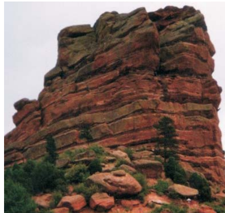
Red Rocks, Morrison, CO

Our favorite part of the trip was the Dinosaur Ridge area. We saw dinosaur bones and other evidences. The tracks were truly amazing and well preserved. Overall it was really fun and interesting.