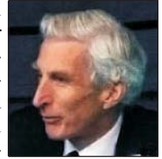
Martin J. Rees

a window on our very humanity, inviting everyone to wrestle with the most fundamental questions of our nature and existence.” He has energetically urged the international scientific community to raise public awareness of the impact of human activity on planet Earth in the 21st century, the first, Rees says, when one species—humans—can determine the future of the entire biosphere. Video clips of his answers to “What effect has your scientific research had on your beliefs?” “How large is physical reality?” “Are human brains capable of understanding the very big, the very small, and the very complex?” “What challenges face science and civilization in the 21st century?” and “World population will be 9 billion by 2050. Can genetically modified (GM) crops help feed the world?” are posted at www.templetonprize.org/video/bigquestions/2011 .