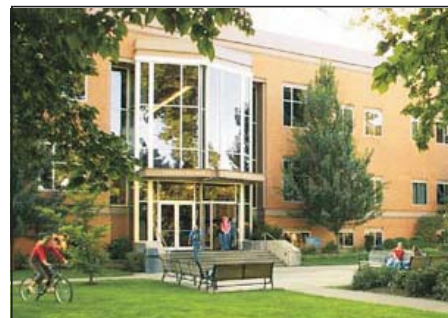
Edwards-Holman Science Center