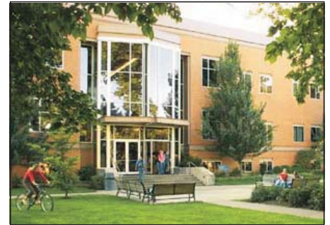
Edwards-Holman Science Center