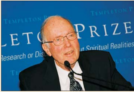
Charles Hard Townes