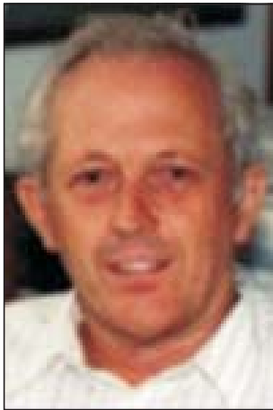
George F. R. Ellis

South African cosmologist George F. R. Ellis, 64, has been awarded the 2004