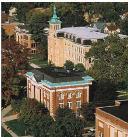
North Central College