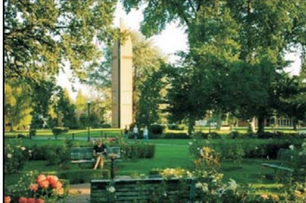
Bell Tower on the Quad

campus. In 1984, the university founded its Center for Peace Learning, now known as the Center for Peace and Justice, as an outgrowth of its connection to the Friends peace testimony.