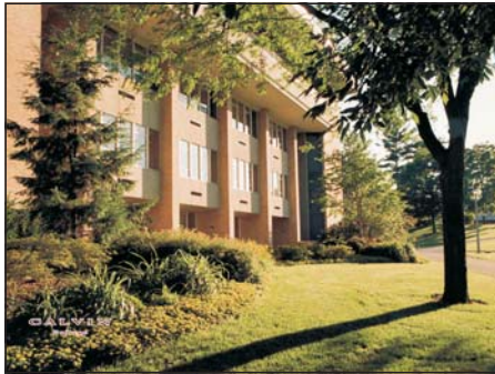
Hekman Library at Calvin College