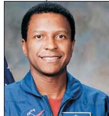
Lt. Col. Michael P. Anderson

Anderson once commented, "As you look back at your life, there are just a million different things that have happened just in the right way, to allow you to make your dreams come true. And you know Someone has all that under control."