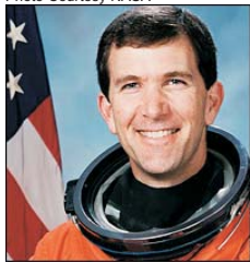
Col. Rick D. Husband

involvement in every aspect of life. Although astronautic ambitions dominated Rick from age 4, President Bush said during the Feb. 4 memorial service, "... hav-