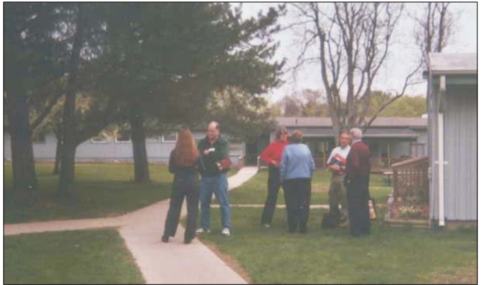
Spontaneous discussions occurred at the annual meeting of the Science, Technology and Faith Ecumenical Roundtable on the campgrounds of the Emrich Retreat Center in Brighton, MI.

As a newsletter, this publication presents news spanning a spectrum of activities, reports, and publications in order to keep readers abreast of a variety of events and views. Just as newspapers report statements made by people of various viewpoints and opinions without endorsing them, inclusion in this newsletter does not constitute or imply official ASA endorsement.