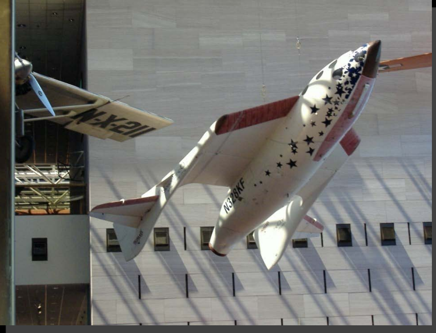
Commercial Space Rocket