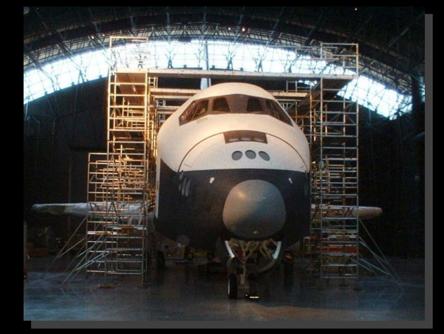
Space Shuttle (Udvar-Hazy Museum)