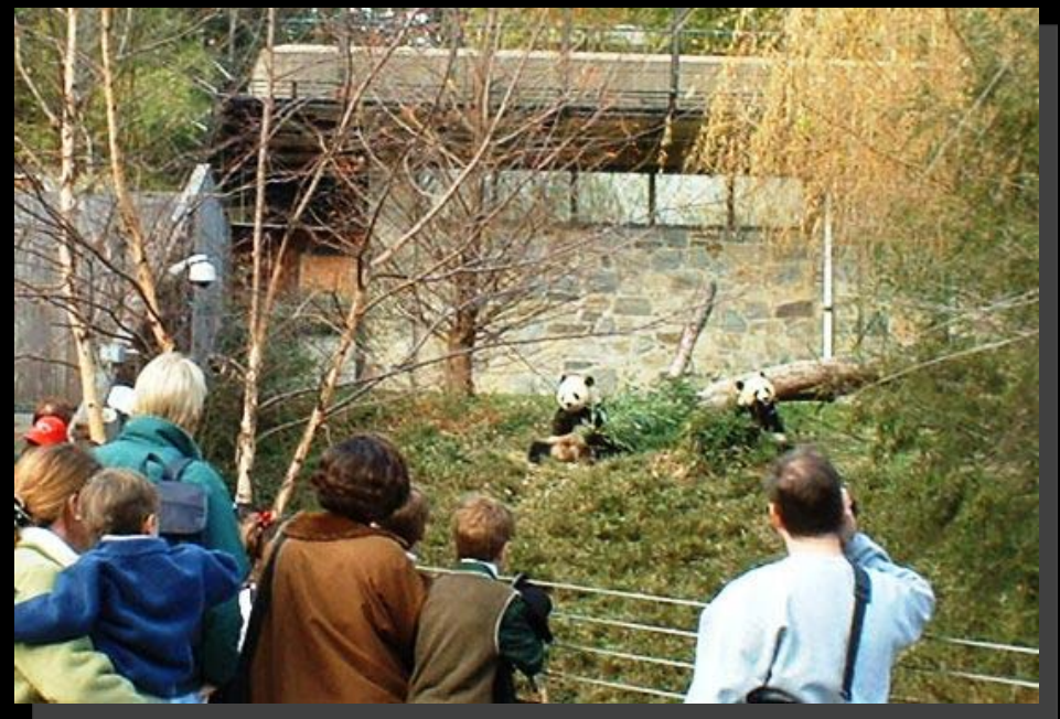
Pandas at National Zoo