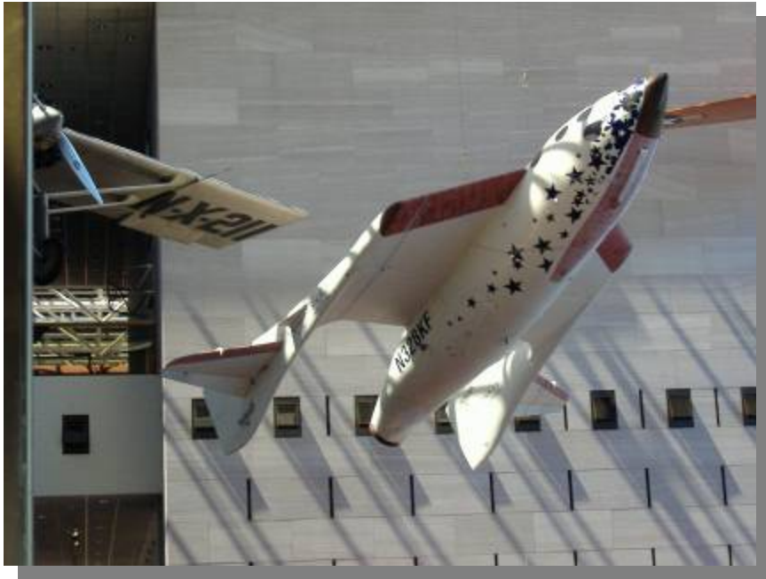
Commercial Space Rocket