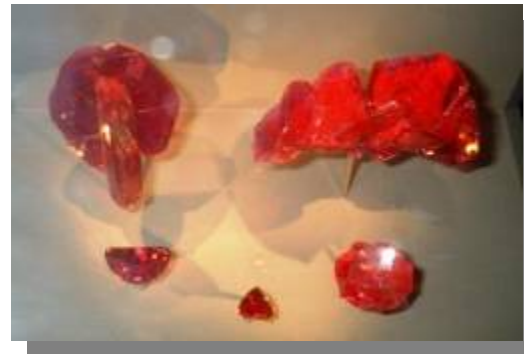
Rubies in Gems & Minerals Hall