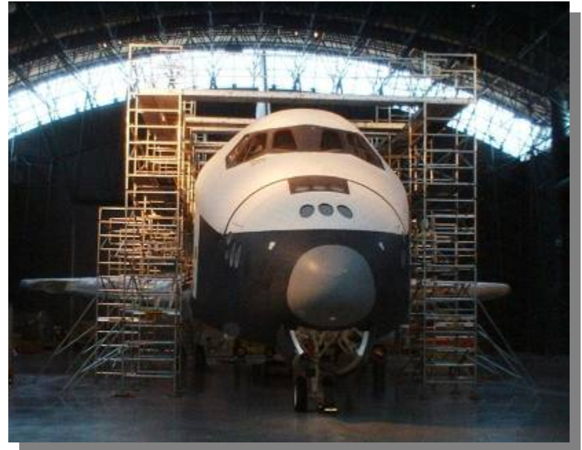
Space Shuttle (near Dulles Airport)