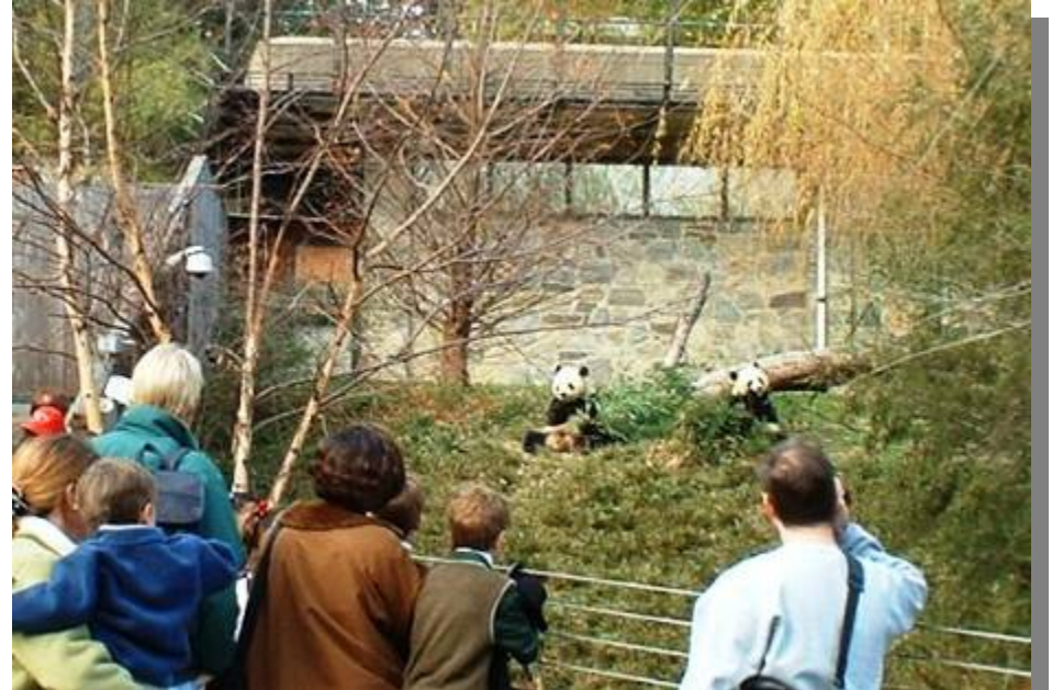
Pandas at National Zoo