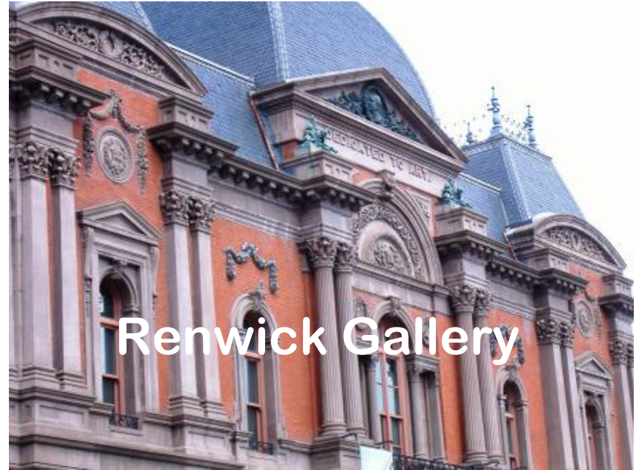
National Gallery of Art