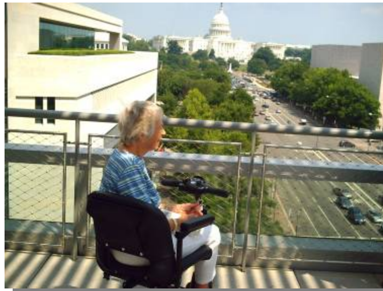
See the Capitol From the Balcony of the Newseum