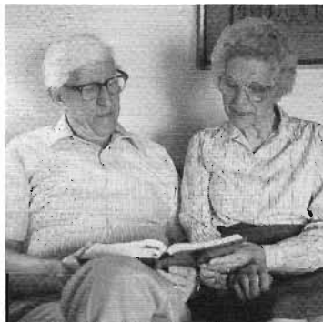
Reading the Bible together

Emphasis on auditory communication stretches throughout the Bible: from God's direct conversation in the Garden of Eden (Gen 2 & 3) to the warning to anyone "who hears the words of the prophecy of this book" not to change them (Rev 22:18-19). The great Shema ("Hear, O Israel") is associated with the giving of the Mosaic law (Deut 6:4-9). And Jesus frequently repeated the phrase, "He who has ears to hear, let him hear" (Matt 11:15).