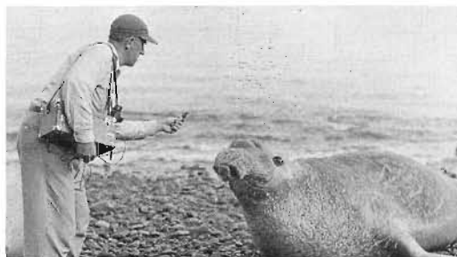
Would you repeat that, please?