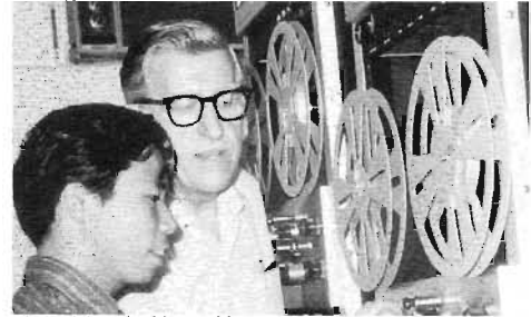
Teaching in Hong Kong (1972)