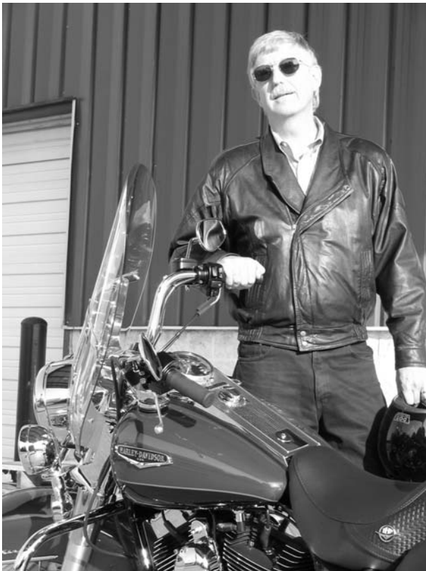
"The Language of Speed"

[O]ne rainy night in May 1989, the answer finally came. There spilling out of the fax machine Lap-Chee and I had set up in the Yale dormitory where we were both attending a meeting, was the data from that days work in the lab—showing unequivocally that a deletion of just three letters from the DNA code in the protein-coding part of a previously unknown gene was the cause of cystic fibrosis in the majority of patients. 11