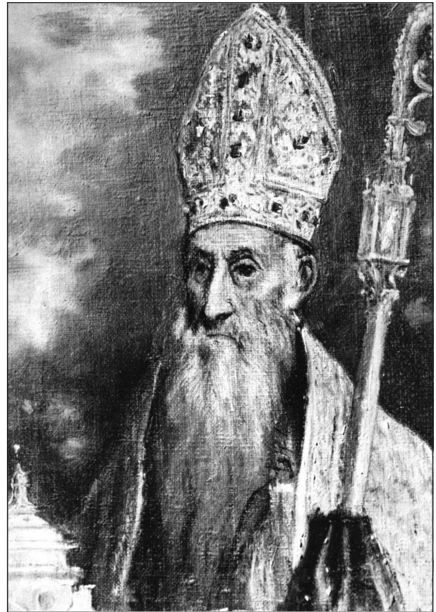
St. Augustine (354–430 AD)

Augustine's thought was highly influential on Christian theology throughout the medieval period and contin-